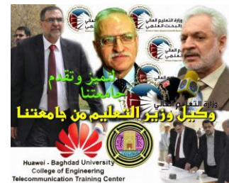
Huawei - Baghdad University College of Engineering Telecommunication Training Center