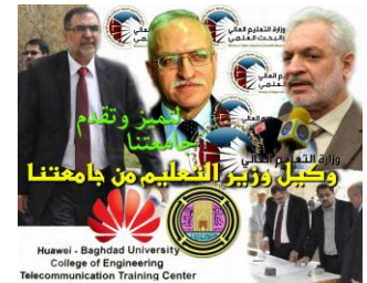
Huawei - Baghdad University College of Engineering Telecommunication Training Center